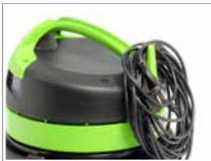
INTEGRATED CORD WRAP